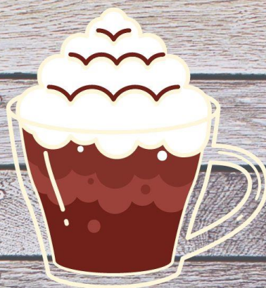
HOT COCOA BAR STARTING AT $4.00 PP