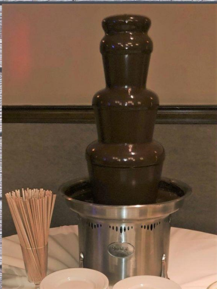
CHOCOLATE FOUNTAIN W/DIPPABLES $450 RENTAL DIPPABLES - $4.00 PP